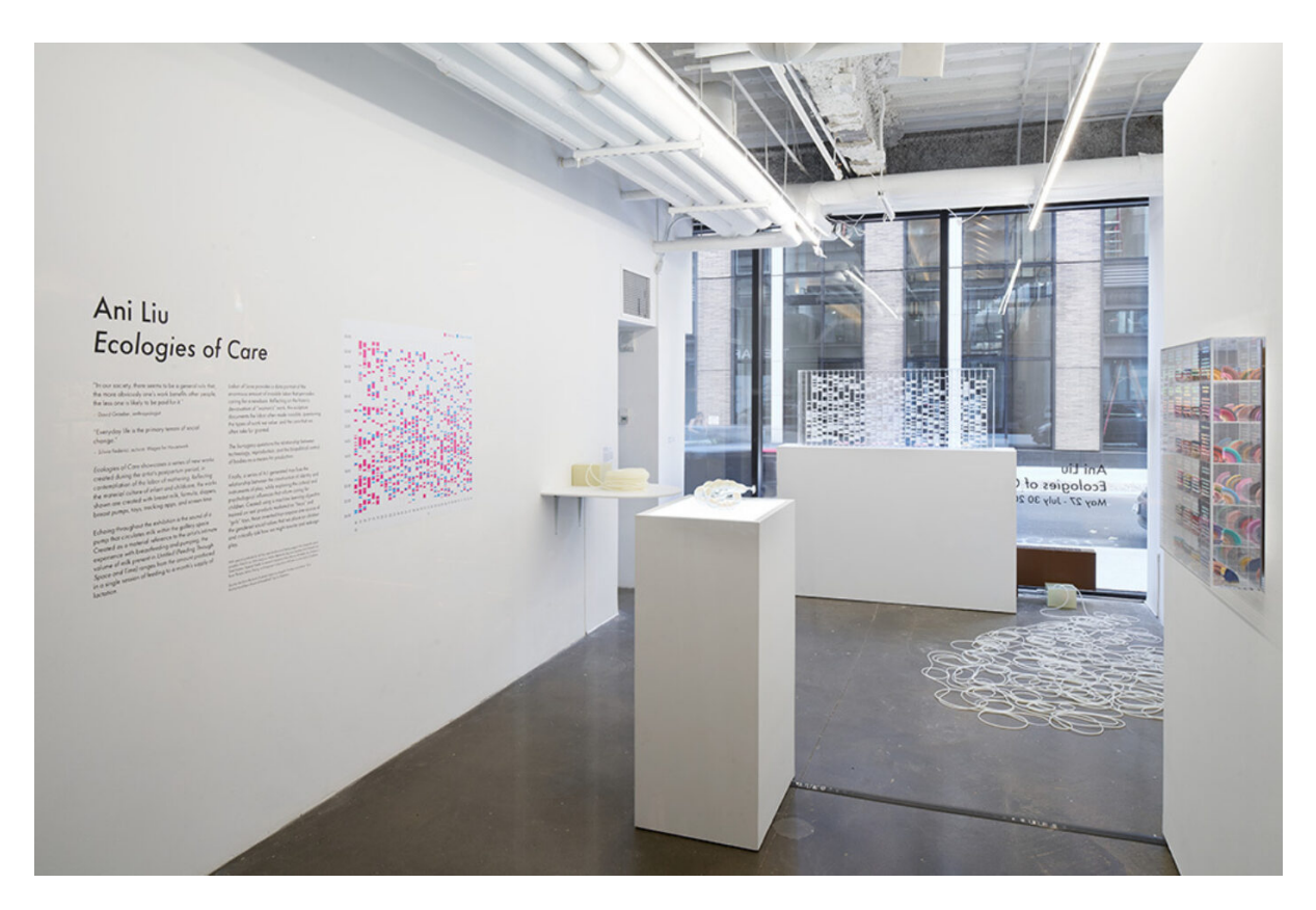
Installation view of Ani Liu: Ecologies of Care , 2022. Cuchifritos Gallery, New York.

I'm grateful for its invention as it allows me to be away from my baby for long stretches while maintaining my supply. In a way, it liberates me to pursue things beyond my motherhood. At the same time, I feel the double edge of this freedom and the expectation to perform the labor of feeding invisibly on top of all the other forms of labor and employment I perform. My calendar is filled with half-hour blocks reserved to pump and clean the parts. My bag has been heavy with it, and I am constantly taking note of the random crevices in public spaces that would function as a lactation space in a pinch. This is a long-winded way to say that I've been pumping for almost eight months now, and this sculpture came out of my experiences with it.